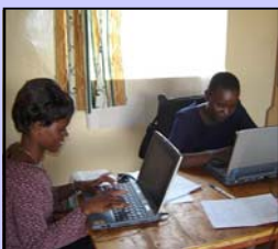
Moi students work on site at Reach-Out.